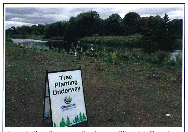
Figure 2: Shoreline Naturalization at Millbrook Millpond, 2019