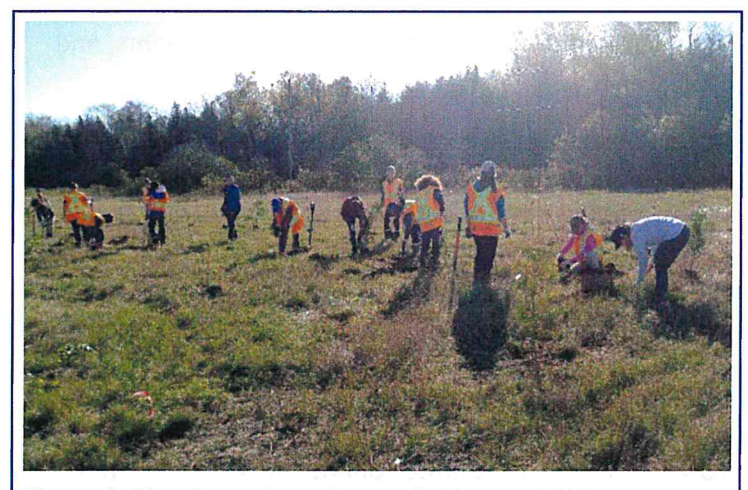
Figure 1: Planting at Peterborough Airport, 2017