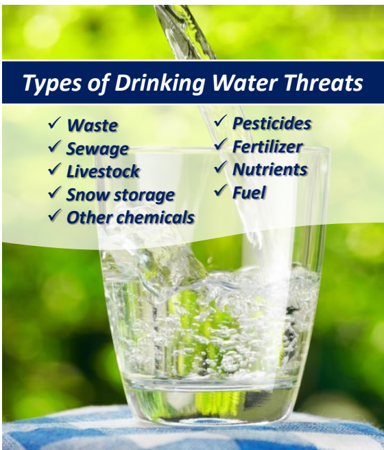
Data Source: Approved Trent Assessment Report dated October 1, 2014